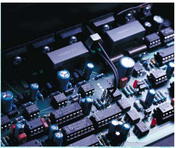
Mape Dynatorque HF-Spindle converter with extreme torque and high load capacity. Used for ball and airbearing spindles.

Mape UK Ltd, Union Bridge Mills, Leeds LS28 9LE, England. TEL ++44 1132 360 966, FAX ++44 1132 360 955. e-mail: mapeuk@aol.com