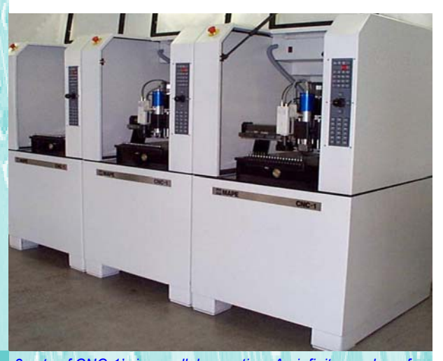
3 sets of CNC-1's in parallel operation. An infinite number of CNC-1's can be linked together for <u>flexible</u> mass production.

In addition, you get added f | e x | b | | | t y and security.