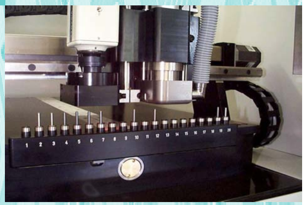
Mape CNC-1 optionally fitted with CCD video camera system for manual programming. Optics magnification 20X for accurate digitizing and zeroing of the machine.